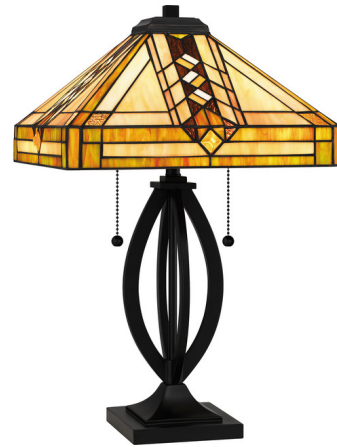
Shown in matte black / multicolor

With its matte black finish and classic Arts and Crafts inspired design, the Yellowstone Table Lamp delivers on both style and function. The geometric shade is made of handcrafted Tiffany glass in shades of cream, warm honey amber, and crimson. The individual glass pieces are hand assembled and carefully arranged in a unique pattern, making Yellowstone a versatile piece in any living room, kitchen, or home office. Dual On/Off pull chain operation.