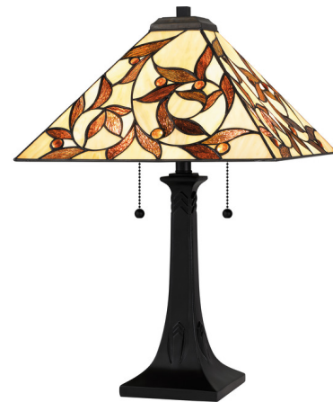
Shown in matte black / multicolor

The Zion Table Lamp features a matte black finish and multicolored glass. The handcrafted shade is made of hand assembled Tiffany glass in shades of cream, warm honey amber, and crimson in a delicate, floral pattern. Illuminate your living room, add style to a home office, or cozy up in your bedroom for some reading. Includes two on/off pull chains.