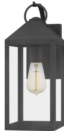
Shown in mottled black / clear

Wow your guests and neighbors with the Thorpe Outdoor Wall Light. Clear tempered glass panels are enclosed in a traditional rectangular frame, providing life-long style and durability.