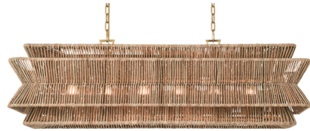
Shown in antique burnished brass / natural abaca

The Antigua Linear Pendant introduces the enduring elegance of nature into your living area. Crafted from hand-woven natural abaca, it envelops a lineal trapezoidal frame, permitting light to filter through and create inviting shadows throughout your space.