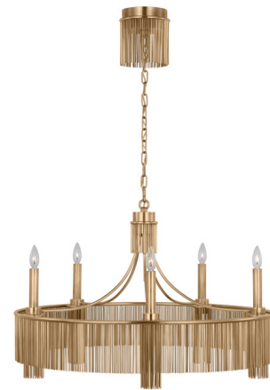
Shown in antique burnished brass

The Sutton Chandelier adds a decorative elegance to your interior space. Curved arms are capped with candle holders and accented with a curtain of spikes that help reflect bold shadows of light across your room. Note: Due to the weight of the largest fixture, additional ceiling support is required.