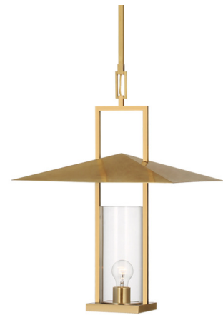
Shown in antique brass / clear

The Amity Pendant draws inspiration from classic Asian lanterns, featuring a geometric design. Its shallow upper shade is divided by an elongated metal trapeze that supports a cylindrical glass, which emits a warm illumination throughout your room. Note: Clear with Antique Burnished Brass is not available in the 32 inch height. Custom Overall Heights are available. For quotes, please contact our sales team.