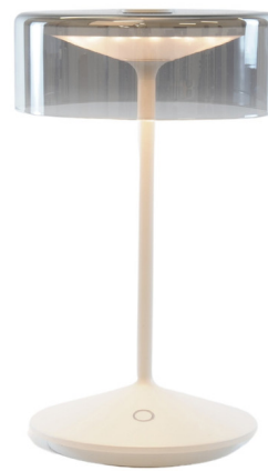
Shown in white / smoke