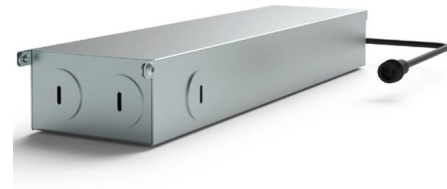
Shown in galvanized