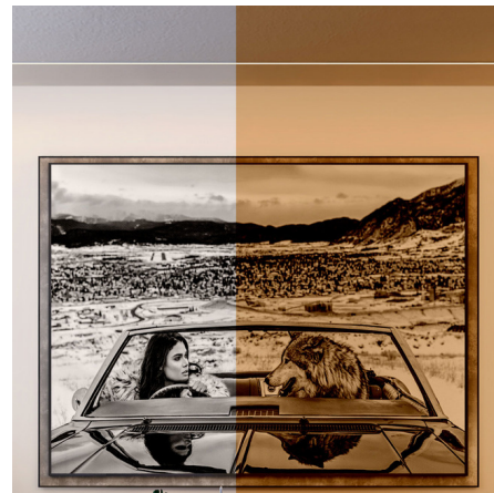
Shown in satin aluminum