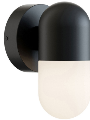
Shown in black / frosted

With a focus on sleek lines and minimal design, the Irvine pendant provides mod flair for the contemporary home. Perfect for a front porch or deck, this pill shaped sconce shines alone or in sets. LED color selectable options include 2700K, 3000K, 3500K, 4000K, and 5000K (CCT). TRIAC and ELV dimming at 120V and 0-10V dimming at 277V.