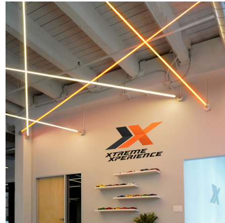
Shown in pure white / white