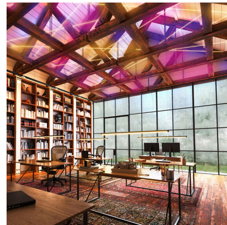
Shown in pure white

LAMP LIFE . . . . . 50000 hours LAMP COLOR . . . . . RGB+White