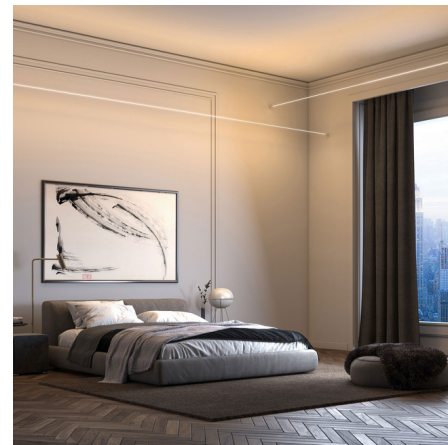
Shown in pure white