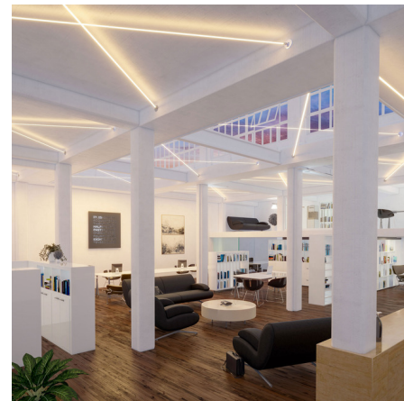
Shown in pure white