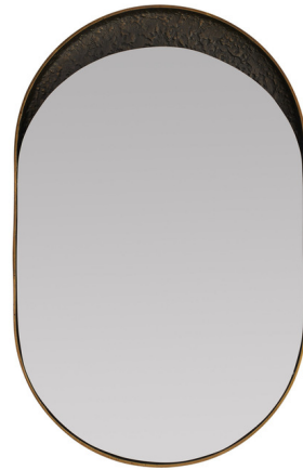
Shown in bronze / mirror

The Inset Mirror explores the concept of filled and unfilled forms, bringing unique dimension to your space. Its smooth, glossy surface is nestled within a deeply textured aluminum frame, creating the illusion of being poured into a void.