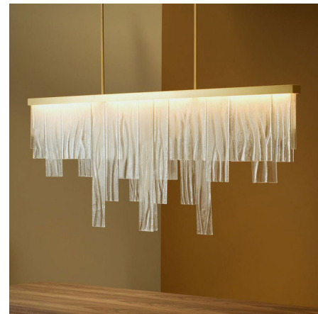
Shown in satin brass / wavy kiln glass

The Cascata Long Linear Chandelier is a uniquely sculptural fixture thanks to its cascading sheets of wavy kiln glass. The chandelier's frame houses an integrated LED light source which shines downwards through the undulating glass to create a dazzling display. Available with Ceiling Rose canopy (with LED driver inside) or flush Mounting Plate (with remote LED driver). Note: Due to the weight of the fixture, additional ceiling support is required. Requires narrow junction box.