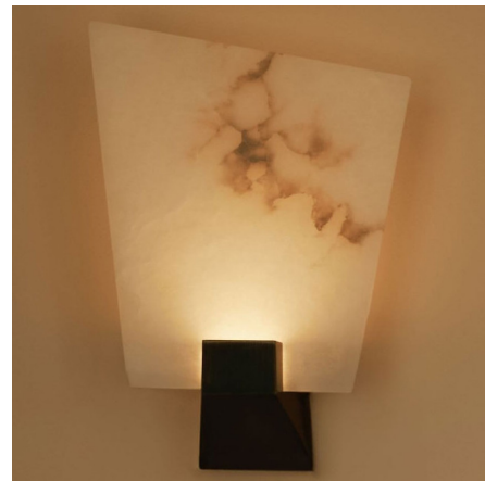
Shown in antique bronze / honed alabaster

The Relic Wall Sconce offers a bold, modern aesthetic with its angular arm and asymmetrical shade in alabaster or artisan kiln glass. The shade is illuminated by an integrated LED to create a bright but soft glow against the wall. The chamfered angles of the arm aid in light refraction and give the fixture a bold, sculptural expression. Includes 4.5 inch square backplate for standard US junction box (not pictured).