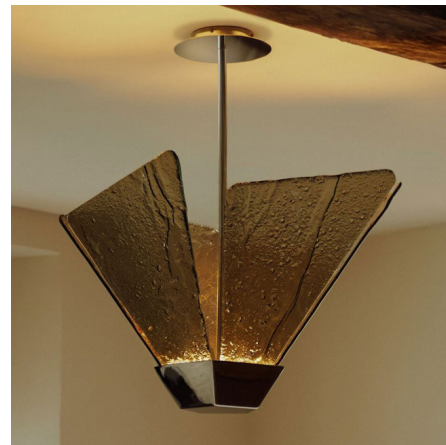
Shown in polished nickel / bronze kiln glass

The Shard Pendant features a pentagonal base with panels of alabaster or artisan kiln glass blossoming outwards like a flower. Shard's sharp angles and raw materiality recall the roughness of brutalist designs, while the soft upward illumination creates a gentle and elegant expression. Shard will serve as a bold centerpiece in a dining room, living room, or foyer.