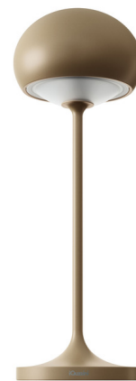
Shown in champagne / opal

LAMP LIFE 50000 hours COLOR RENDERING 80 CRI LAMP COLOR Tunable White LUMENS/WATT 46.36 LUMINOUS FLUX 102 lumens