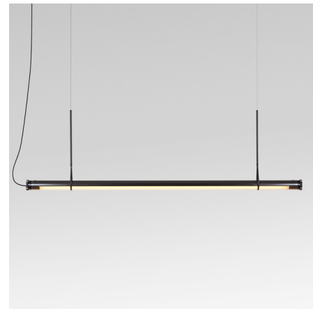
Shown in black / clear

COLOR RENDERING . . . . . 90 CRI LAMP COLOR . . . . . 2700K LUMENS/WATT . . . . . 76.80 LUMINOUS FLUX . . . . . 2258 lumens