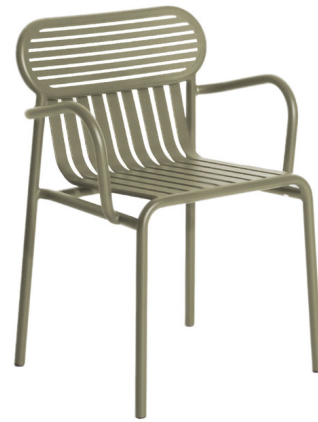
Shown in jade green

The Week-End Bridge Chair brings contemporary grandeur into your outdoor entertaining space. Made of highly durable Aluminum and coated with a weather-resistant powder coating, the Week-End's modern appeal works well with a number of sleek decors. Up to 6 chairs are stackable when not in use. Includes 2 chairs. Note: Suitable for outdoor covered locations.