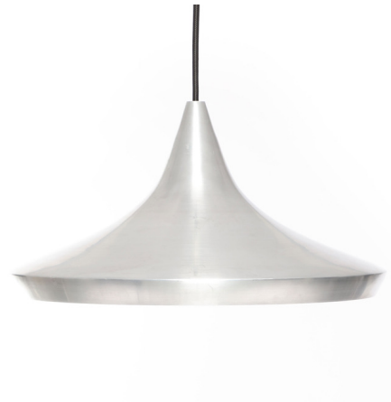
Shown in aluminum

COLOR RENDERING . . . . . 90 CRI LAMP COLOR . . . . . 3000K LUMENS/WATT . . . . . 88.89 LUMINOUS FLUX . . . . . 800 lumens