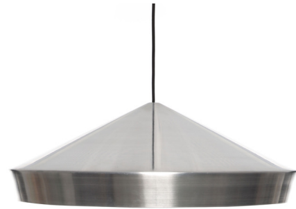
Shown in aluminum