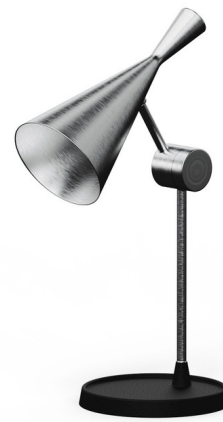
Shown in aluminum / black

COLOR RENDERING . . . . . 90 CRI LAMP COLOR . . . . . 3000K LUMENS/WATT . . . . . 88.89 LUMINOUS FLUX . . . . . 800 lumens