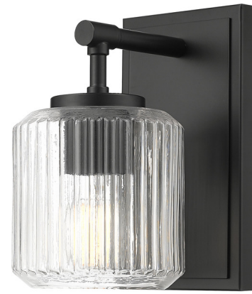
Shown in matte black / clear ribbed

The Landon Wall Sconce features a ribbed clear glass diffuser to create an enchanting sparkle. The cylindrical shade and rectangular backplate give the fixture a clean-lined, elegant aesthetic that will complement a wide variety of decor styles and settings. May be mounted with the shade pointed up or down.