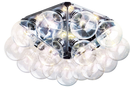
Shown in aluminum

Unleash a dazzling display of light with the Flos Taraxacum 88 Wall / Ceiling Light, a spectacular creation inspired by Achille Castiglioni's original pendant design from 1960. This fixture is a true work of art, featuring five polished aluminum triangles meticulously adorned with an array of globe-shaped LED bulbs. This unique configuration ensures a dynamic spread of both direct and reflected light, bathing your space in a brilliant, multi-faceted glow. Whether mounted on the wall or ceiling, the Taraxacum 88 will instantly add a dramatic flair and a touch of mid-century modern genius to any interior. It's more than a light source; it's a luminous sculpture that commands attention and admiration.