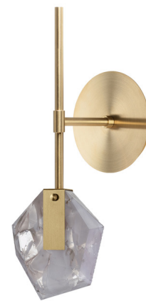
Shown in brushed gold / white fragmentglass

COLOR RENDERING . . . . . 90 CRI LAMP COLOR . . . . . 2700K LUMENS/WATT . . . . . 83.33 LUMINOUS FLUX . . . . . 100 lumens