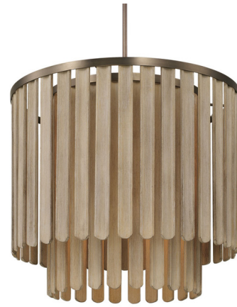
Shown in dark brass / mango wood

Crafted from mango wood, the Jada Pendant fuses organic materials with modern style. Distressed with a soft grey finish, the wood pieces are complemented by the dark brass metal frame. Use in a dining room, kitchen, or anywhere general illumination is needed.