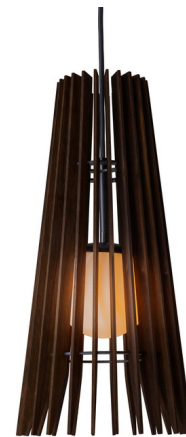
Shown in black / dark stained walnut

COLOR RENDERING . . . . . 90 CRI LAMP COLOR . . . . . 2700K LUMENS/WATT . . . . . 101.67 LUMINOUS FLUX . . . . . 915 lumens