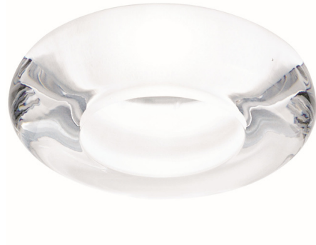
Shown in clear

The Faretti Tondo element, composed of hand-poured Italian crystal, is an artful masterpiece able to uniformly distribute the light in any place of the room. Sold as a complete fixture (includes trim and housing). Choice of housings include: Remodel, Non-IC New Construction, or IC New Construction.