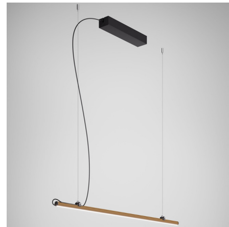
Shown in bronze

The Freeline is an essential linear pendant that provides adjustable direct or indirect illumination for residential and contract applications. The low-profile (less than 1 inch in diameter!) grooved rod houses the linear LED lighting element. Suspended from aircraft cables and connected with adjustable clamps, the rod can easily be rotated to change the direction of the light. TRIAC dimming. Note: The floating driver canopy provides mounting flexibility when the junction box location is not ideal. Includes cover plate for U.S. junction box (not shown in line drawing).