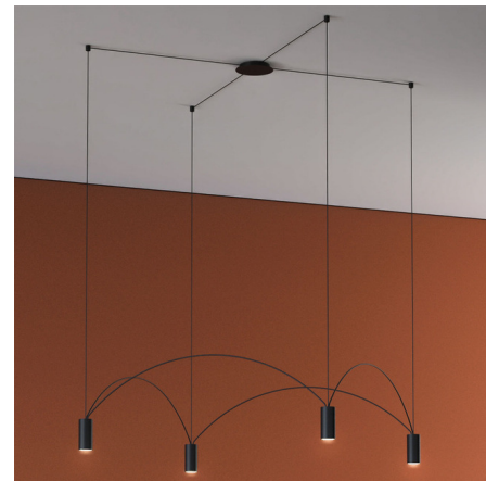
Shown in black

BEAM ANGLE . . . . . 15° COLOR RENDERING . . . . . 90 CRI LAMP COLOR . . . . . 2700K LUMENS/WATT . . . . . 525.71 LUMINOUS FLUX . . . . . 3680 lumens