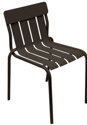
Shown in tonka brown

Originally, the Stripe chair was developed by Fermob as part of a special project at the request of the designer Matali Crasset. She wanted to create a seat to encourage people to talk and share, and that would be easy to move from one table to another, for the new Mini R fast food concept of the student services organization CROUS. This is how Stripe came into being: an aluminum chair with gentle curves, comfortable to use with a handle on the back of the backrest. Tubular aluminum frame, Curved aluminum slats seat, Curved aluminum, slats backrest, Handle on the back of the backrest for easier handling, Silence pads, Stacking capacity : x 8 (Height - stacked : 43,5 in.), Product enhancement : Improved stacking