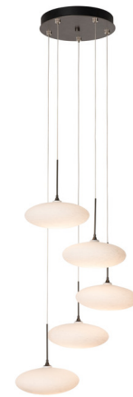
Shown in dark smoke / shell glass

PRODUCT DIMENSIONS . . . . . Min/Max Adjustable Height: 11" - 72"