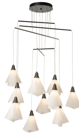
Shown in dark smoke / spun frost

PRODUCT DIMENSIONS . . . . . Min/Max Adjustable Height: 19" - 72"