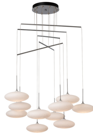
Shown in vintage platinum / shell glass

PRODUCT DIMENSIONS . . . . . Min/Max Adjustable Height: 17" - 76"