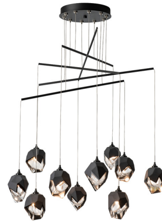
Shown in black / black crystal

PRODUCT DIMENSIONS . . . . . Min/Max Adjustable Height: 16.5" - 88"