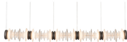
Shown in oil rubbed bronze / clear