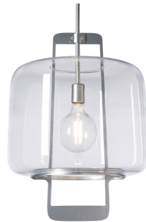
Shown in sterling / clear

PRODUCT DIMENSIONS . . . . Downrods: One 3", One 6", and Three 12" Included