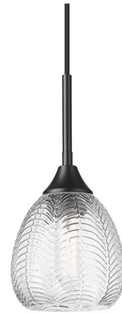
Shown in matte black / clear

Elegance redefined, the Berkshire Collection offers a seamless fusion of classic sophistication and contemporary flair. Characterized by its distinctive herringbone pattern, each fixture presents a unique and refined aesthetic. The clear glass components enhance this modern appeal, allowing light to disperse captivatingly and illuminate any space with a warm, inviting glow. NOTE: This is a cord hung pendant and includes 120 inch field adjustable cord.