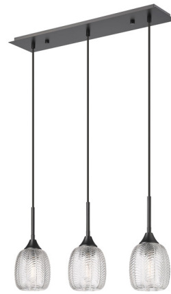
Shown in matte black / clear

PRODUCT DIMENSIONS . . . . . Adjustable Cable Lengths: 120"