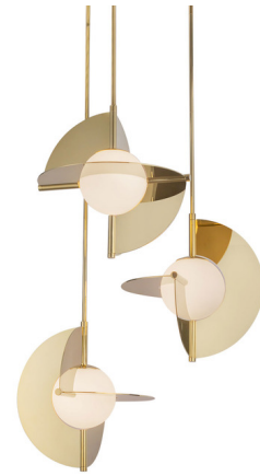
Shown in metallic brass / opal