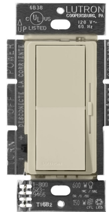
Shown in satin clay

Diva 120-277V Operating Voltage 0-10V dimmer provides dimming control of 0-10 LED drivers and fluorescent ballasts. Switch rating of 8A. Controls up to 25 ballasts or drivers. Features a large paddle switch and linear-slide dimmer that can be preset. Available in satin and gloss finishes. Single pole/3-way. Note: Claro designer wall plate sold separately. NOTE: Power pack cannot be used with DVSTV model.