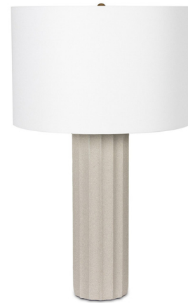
Shown in concrete / natural linen

PRODUCT DIMENSIONS . . . . . Cord Length: 96"