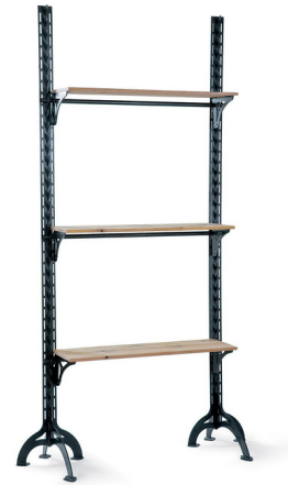
Shown in blackened iron

Made of solid wood and steel legs the Detroit Shelving Unit has an industrial presence while being aesthetically pleasing. With movable shelves, it allows you to choose the space requirements you need. Handmade in Regina Andrew's Live from Detroit workshop this process makes each piece subtly one-of-a-kind.