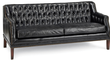
Shown in black / black

This collection is a classic with a twist. Shaking off the stuffy heritage of what is expected of a tufted leather sofa, the Equestrian Collection has some grit and character by covering it with Regina Andrew's signature, distressed Rock-n-Roll Argentine vintage black leather.