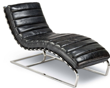
Shown in polished stainless steel / black

Combining elegant curves and distinctive leather, the 1960s-inspired leather chaise lounge is gracefully contoured to comfortably hug the body while remaining keenly attuned to modern-day living.