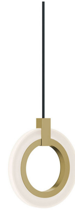
Shown in antique brass / frosted