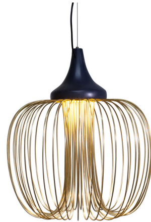
Shown in black / brass

PRODUCT DIMENSIONS . . . . . Adjustable Cord: 59"