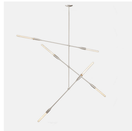
Shown in brushed nickel / nickel details

The Sorenthia 3-Arm is a modern, linear pendant with bold, elegant lines and dramatic negative space. The custom-made light fixture incorporates an element of the organic in its design language with long, reaching arms that can be adjusted on site, allowing for a wide range of angles and orientations. Versatile and dynamic, this statement piece adds a contemporary design element to your space.